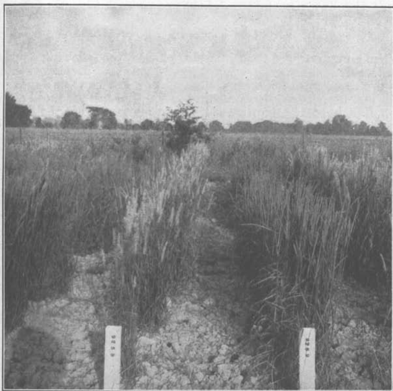
FIGURE 2.—Early timothy (left), all plants are in full bloom; late timothy (right), none of the plants are yet in full bloom.

Timothy is considered the standard roughage for horses and mules and is especially valuable when free from dust. The clear timothy hay is preferable for light horses, work horses, and mules, while a mixture with clover when cut early is a more satisfactory roughage for dairy and beef cattle.