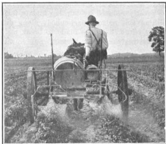
FIG. 3.—Traction sprayer with nozzle arrangement for side spraying, of type useful for spraying beans for the bean ladybird.

Arsenicals possess some killing properties, but act mainly as repellents or preventives of attack.