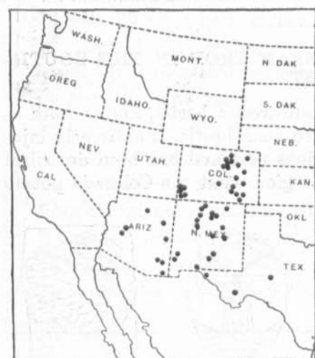
FIG. 2.—Map showing known distribution of the bean ladybird to June 1, 1919.

The female deposits her yellowish brown eggs, which measure about 1.2 mm. in length and half that in width, in large clusters on the under surface of the bean leaves (fig. 1, d ). The larva