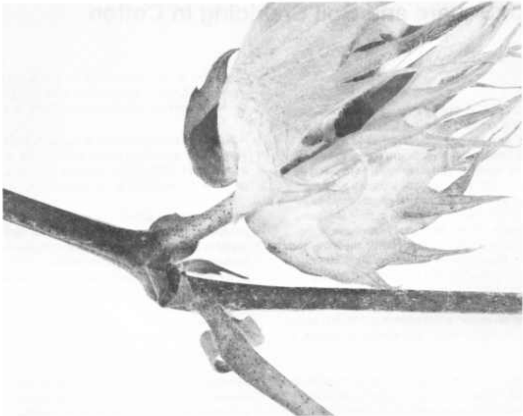
Figure 1.—Young cotton boll with barely visible abscission zone.