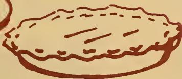
and pie crusts