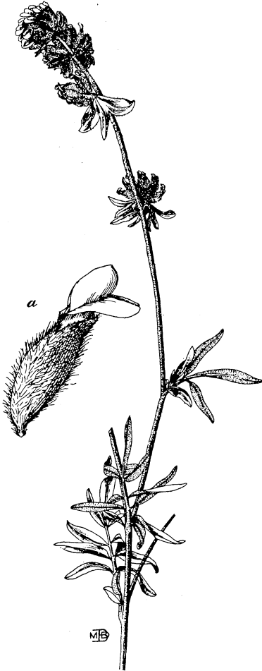
FIG. 4.—Kidney vetch ( Anthyllis vulneraria ). a, flower.

Spring vetches are not recommended as a forage crop for general cultivation. They have value for some few northern localities, but have proved a signal failure elsewhere in this country. The plants come into flower very unevenly, so that sometimes the seed does not ripen in sufficient quantities at one time to pay for harvesting. The crop is liable to injury by drought and excessive heat.