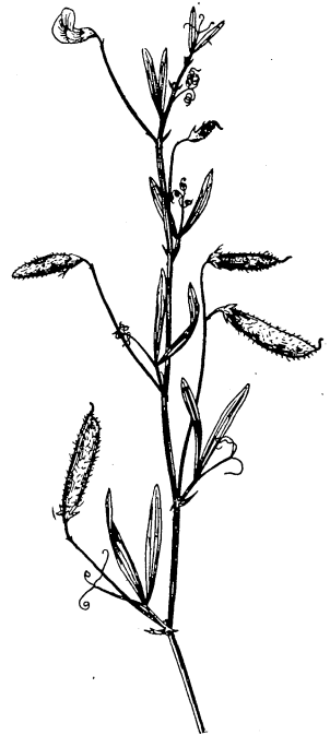
FIG. 3.—Winter vetch ( Lathyrus hirsutus ).

The percentage of digestibility of spring vetch forage has not been determined in this country, but analyses show a high food content comparable with alfalfa rather than the clovers. The average sample of vetch hay contains 11.3 per cent water, 7.9 per cent ash, 17 per cent crude protein, 25.4 per cent fiber, 36.1 per cent nitrogen-free extract, and 2.3 per cent fat. The flat pea and the soy bean are the only leguminous fodders which exceed this in the crude protein content.