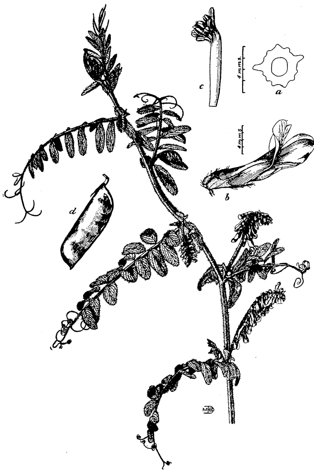
FIG. 1.—Hairy vetch or sand vetch ( Vicia villosa ). a , cross-section of stem; b , flower; c , stamens; d , pod.

vetch. Its cultivation was then neglected until its reintroduction about twelve years ago by this Department. It has since been tried in various parts of the United States. Excellent reports as to its drought-resisting qualities and its adaptability to our climate have been received from Washington, Nebraska, Georgia, New Mexico, South Dakota, Minnesota, Montana, and Pennsylvania. It has been grown on the experimental grounds of the Department of Agriculture at Washington, D. C., and has proved to be thoroughly adapted