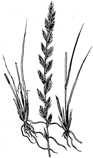
FIG. 1.—Western wheat-grass ( Agropyron spicatum ).

As a rule, the forage obtained from the average prairie pasture is furnished by a comparatively small number of species. In the more thickly settled portions of the great prairie States big blue-stem, bushy blue-stem, the wheat-grasses, switch grass, prairie June-grass, wild-rye, blue-joint, and the various species of Stipa , Poa , and Bouteloua furnish most of the native pasturage.