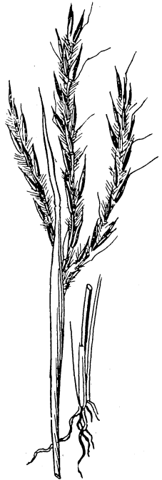
Fig. 3.—Big blue-stem ( Andropogon provincialis ).

The practice of collecting the seeds of such native species as western wheat-grass, slender wheat-grass, wild-rye, prairie June-grass, and the blue-stems and