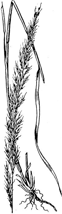
FIG. 4.—Bushy blue-stem ( Andropogon nutans ).

sowing them on the pasture is to be recommended. The writer recalls an instance where a farmer in South Dakota obtained an excellent pasture by collecting western wheat-grass and filling in the bare places with it. Where the wheat grasses are naturally abundant excellent results have been obtained by plowing up the pasture and keeping the stock off of it until these grasses take possession, which occurs in a very short time.