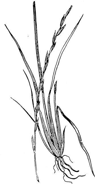
FIG. 2.—Slender wheat-grass ( Agropyron tenerum ).

An experiment made at the Kansas Station in 1892 shows what a thorough stirring up of the soil will do for an upland prairie pasture. The experiment was made on a pasture in which the grasses had been dying out for some time and the weeds were beginning to appear in abundance. It had been reduced to this condition by drought and overpasturing. The surface was thoroughly loosened up by driving a weighted disk harrow over the field in several directions. The pasture was sown to a mixture of orchard grass, meadow fescue, blue grass, timothy, red top, clover, and alfalfa, which was harrowed in and a roller was driven over the field to level the surface and firm the ground. The seed germinated quickly and the tame grasses made an excellent start, but by September the wild grasses had crowded them out and held complete possession of the field.