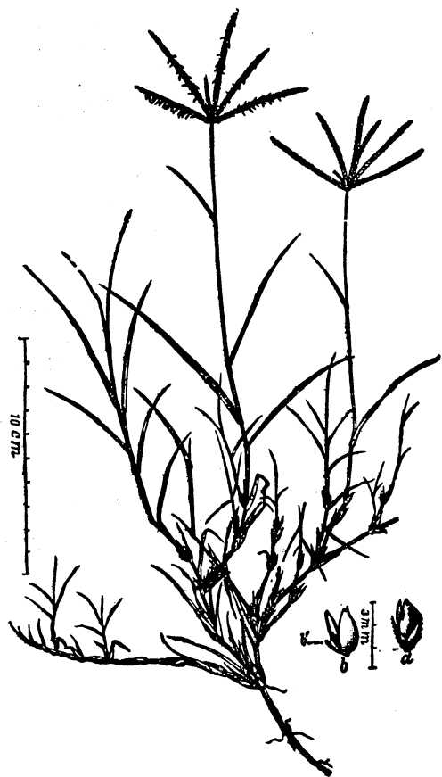
FIG. 1.—Bermuda grass.

In the United States it is commonly known as Bermuda grass, which suggests that it may have come to America by way of the islands of that name, though