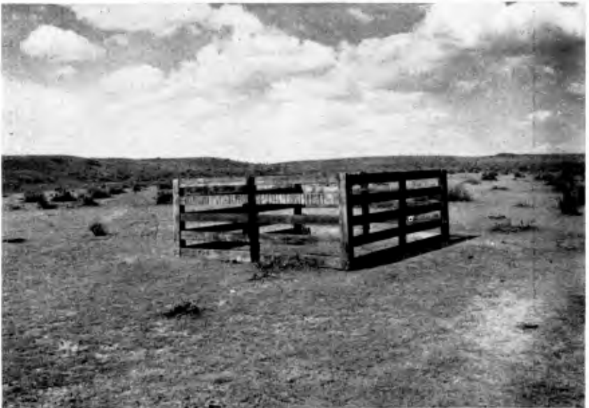
FIGURE 7.—Excellent short-grass range, the same shown in figure 6, at end of a drought season (1939). The grass is short, and no seedstalks were produced even inside the pen, which excluded cattle. However, few bare spaces are visible.

The density of the almost unbroken turf on excellent range appears to vary little from year to year. Appearance of the forage crop varies distinctly from season to season, however, principally because of fluctuations in vigor and amount of growth of the short grasses, in abundance of taller grasses, and in seed production by all grasses.