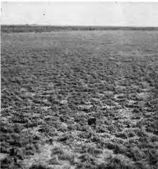
FIGURE 3.—Fair short-grass range on which heavy grazing or drought or both have widened the bare spaces between grass clumps to as much as 12 inches and removed most of the perennial weeds.

Perennial weeds of fair to good palatability are scarce and may be found only around anthills and in places where moisture accumu-