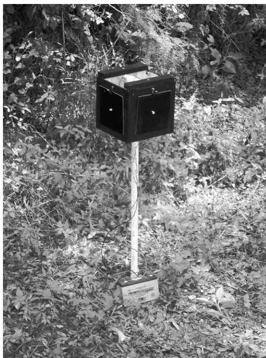
Fig. 1. Four sided, light-emitting diode-equipped sticky card box. One 13 × 13 cm sticky card and one diode were affixed to each exterior wall of box.

Diode-equipped sticky card (DESC) studies were conducted using 20 × 20 cm wooden boxes with 4 sides and an open top and bottom constructed from exterior-grade plywood. Each of the 4 outside surfaces was painted with flat black paint (Valspar, Wheeling, IL). A 13 × 13 cm black sticky card (EPA no. 057296-WI-001, Atlantic Paste & Glue Corporation, Brooklyn, NY) was affixed to the exterior of each wall with 1 LED centered per vertical side. Black cards were selected to reduce variability of reflected light from LEDs. A hole drilled into the center of each sticky card and the box allowed for insertion of an LED from the inside of the DESC boxes so LEDs protruded outward through glue boards.