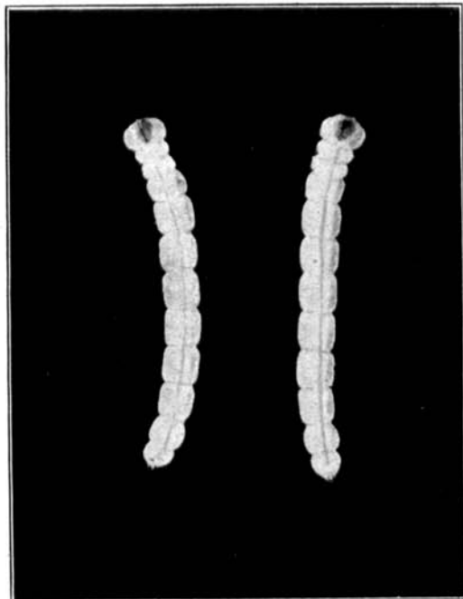
FIG. 2.—Larvæ of the red-necked cane-borer, ventral view. Much enlarged.

from the two-spotted raspberry cane-borer 2 which belongs to the long-horned borers. 3