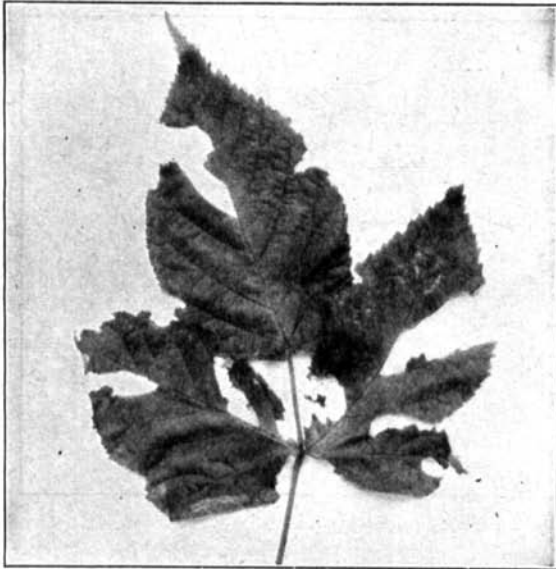
FIG. 4.—Blackberry leaf taken some time after attack by beetles of the red-necked raspberry cane-borer, showing enlargement of original holes made by the beetles in feeding.

The beetles make their first appearance in the District of Columbia and vicinity some years as early as the first week in May. In more northern regions they appear some time in June, continuing until August, the time of appearance being coincident with the blooming of the raspberry. They deposit their eggs on young growth, first