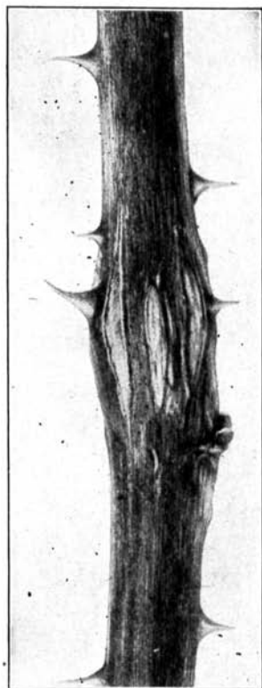
FIG. 5.—Section of blackberry cane showing gall or enlargement at middle, caused by larva of red-necked raspberry cane-borer.

Cooperation in the observance of this measure with neighboring growers of these fruits is highly desirable and should be continued for successive years, or as long as the galls or swellings are to be seen in any number.