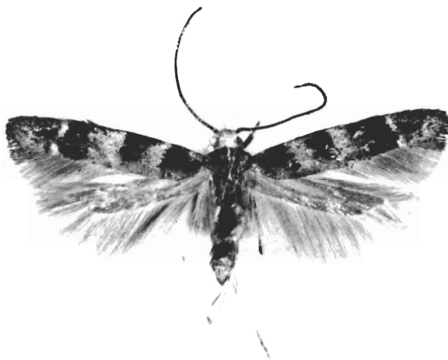
FIG. 1. Exoteleia anomala , new species, holotype male.

R. Stevens; Hopkins U.S. #36961. Paratypes: 11 males, 8 females; same data as for holotype; USNM genitalia slides #10893–10902. 2 males, 4 females; Arizona, 10 km N Fort Apache; Pinus ponderosa , J. M. Schmid; Hopkins U.S. #66729, reared 8/82; USNM genitalia slides 11745–11748. In collection U.S. National Museum of Natural History.